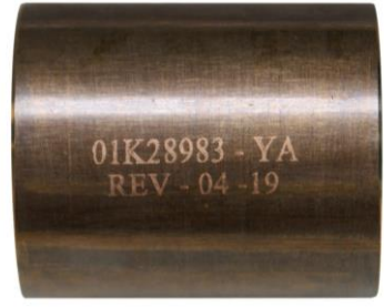
Figure 1 Connecting Rod Bushing (P/N 01K28983)

NOTICE: The new connecting rod bushing P/N 01K28983 will have the part number etched on the outside diameter of the bushing (Figure 1). Future versions of this bushing will be marked 01K28983-B or later revision letter, have a different lot code, and be identified with a notch in the edge of the bushing.